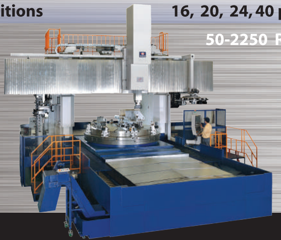
Y-AXIS PLANAR OPT.