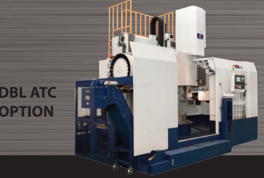
DBL ATC OPTION